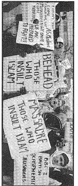
MILITANT... Islamic protesters march in London on Friday

And I am alarmed that our police seem paralysed in the face of blatant incitement to